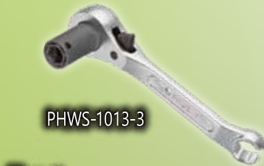
Short Suspended Band Wrench